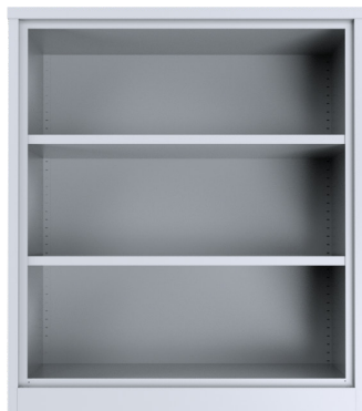
2 shelf unit